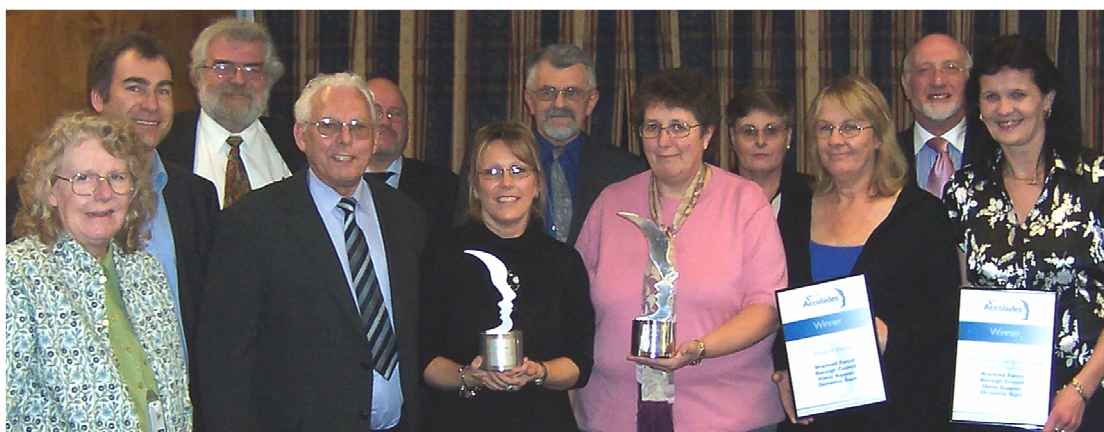
Panel Members meeting the Council's award-winning Adult Social Services Dementia Team

Looking forward, a range of strategic reviews which the Panel could usefully pursue in the 2008/09 municipal year is set out in Appendix 3.